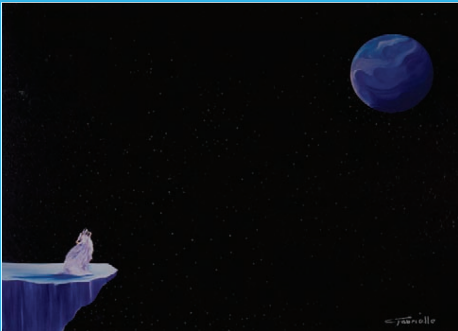
Luna Del Lupo , Oil on Canvas, 30" x 40"