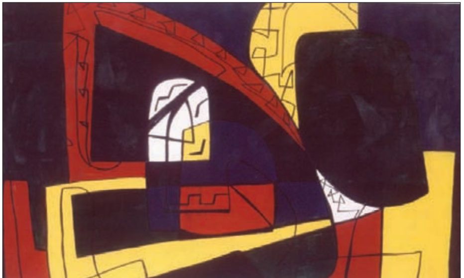
Dynamic , Oil Enamel on Paper, 19.5” x 26.5”