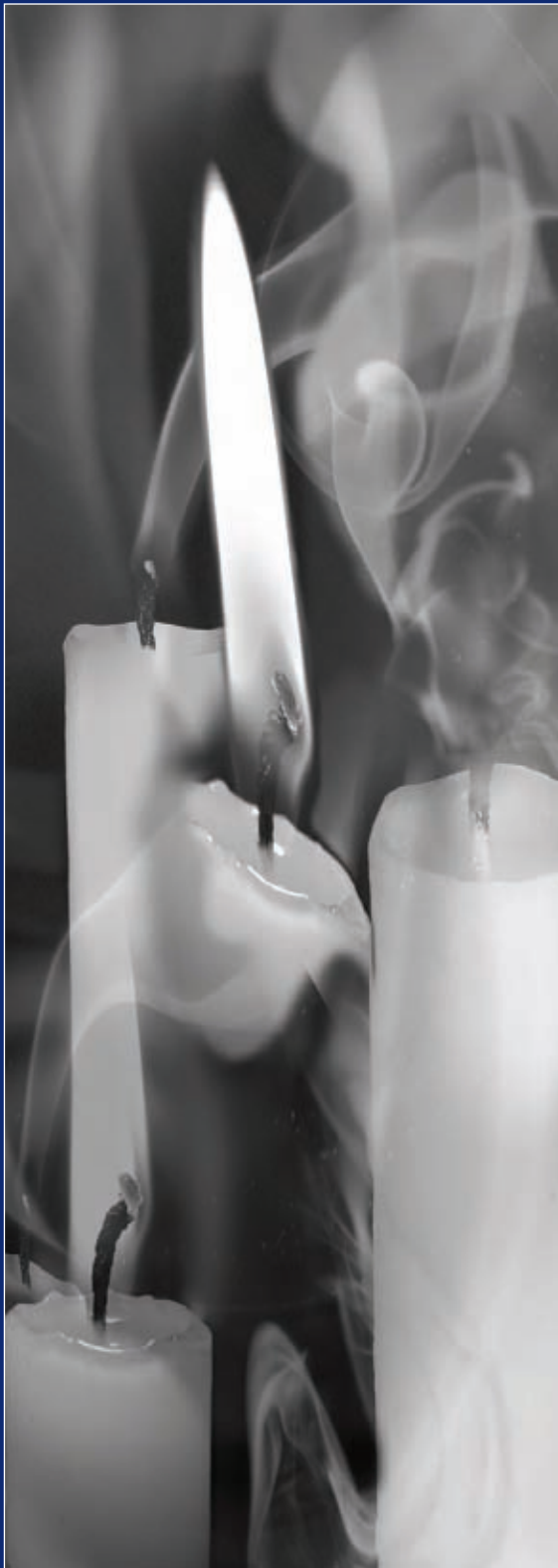
Mspar 2145 Digital Photomontage, 29 ½" x 12"

and space as of color. Vibrant hues jump off the works, particularly when the subject is backlit or when just one feature of theirs is emphasized with a dynamic shade. Mr. Lewis can create either timeless, sentimental works or stunningly provocative studies of form. His oeuvres are mysteriously filled with the subconscious and the surreal, the dance of what might be, and of what lurks in the depths of the mind.