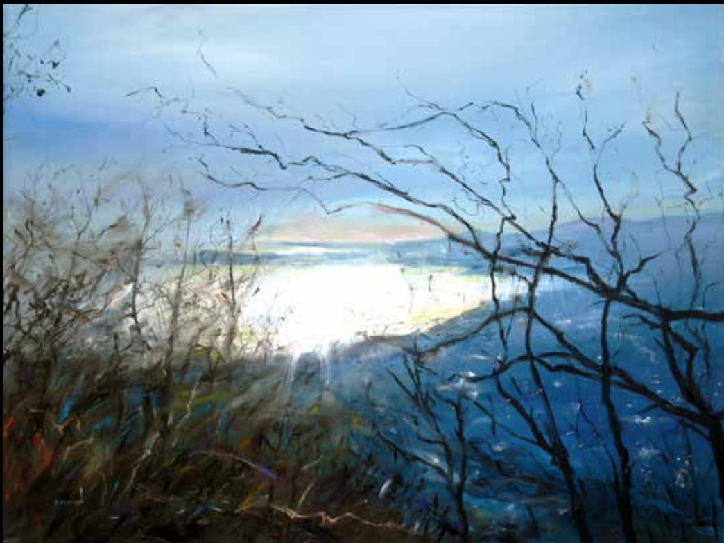
"Descending Vesuvius" Oil on Canvas 40" x 30"