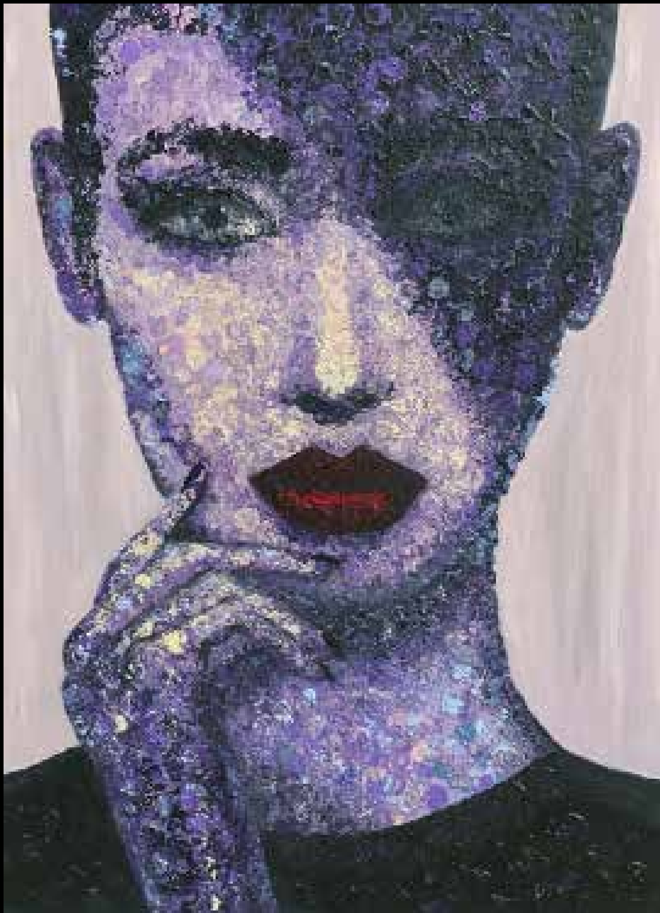
"Violette" Acrylic & Oil on Canvas 48" x 36"