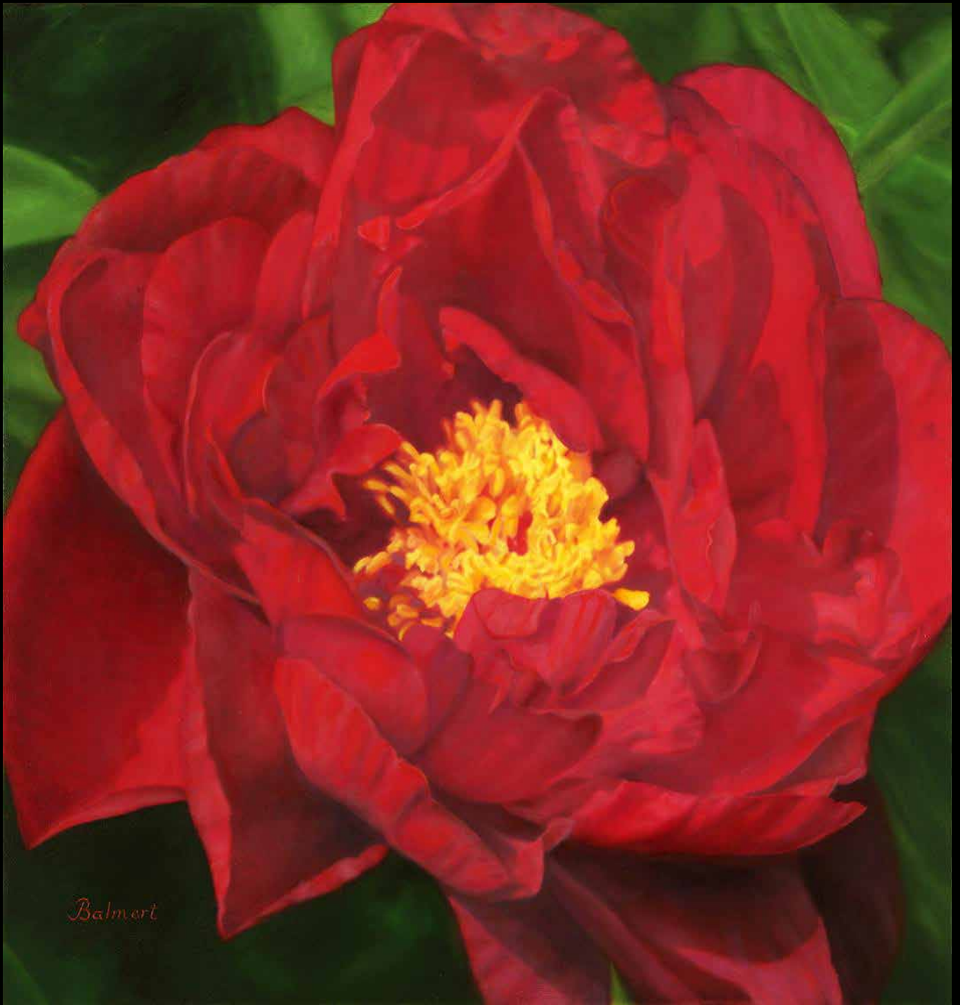
"Topeka Garnet Peony" Oil on Canvas 24" x 24"