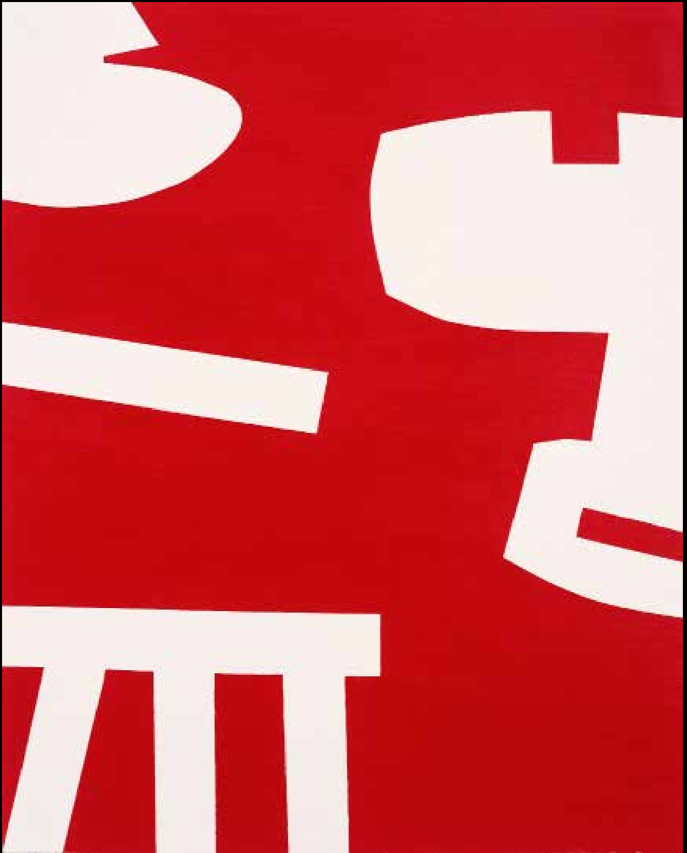
"Cinco V" Oil on Canvas 19.6" x 15.7"