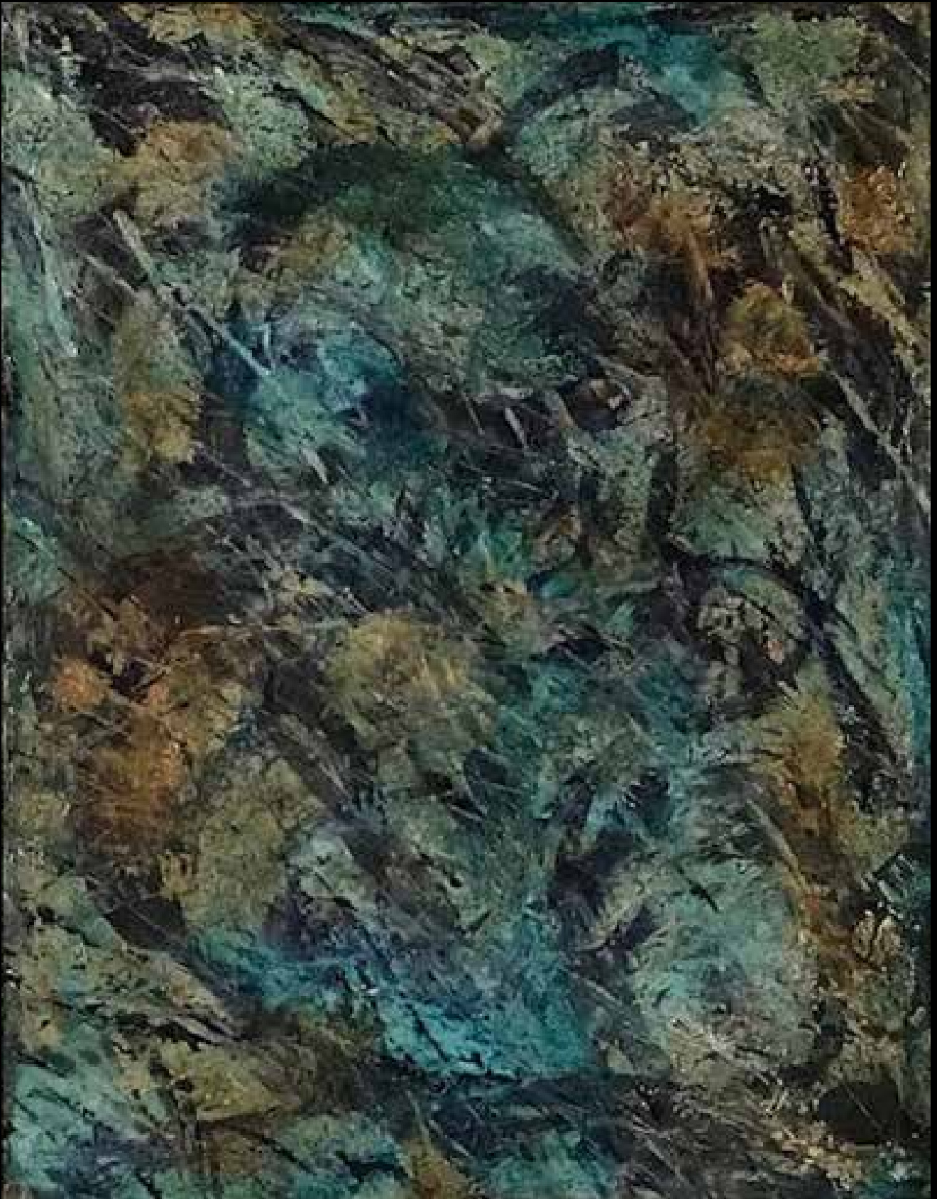
"Care of the Soul" Acrylic on Canvas 24" x 18"