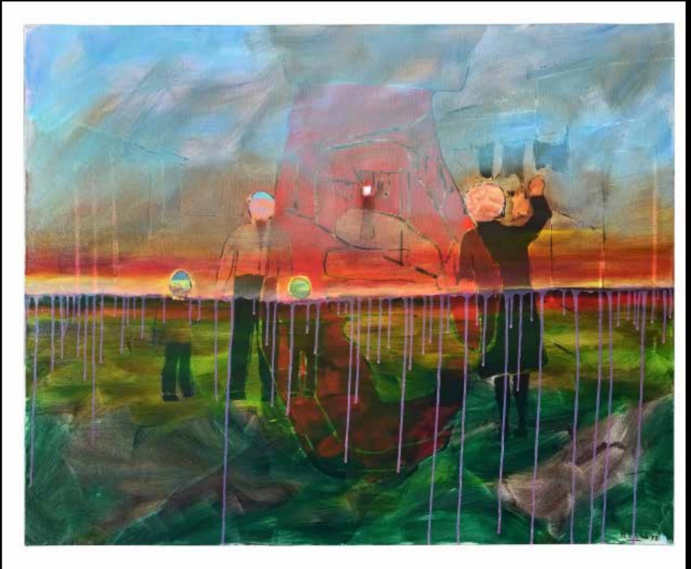
"New Horizons 155 "The Family" Oil & Collage on Canvas 31.5" x 39"