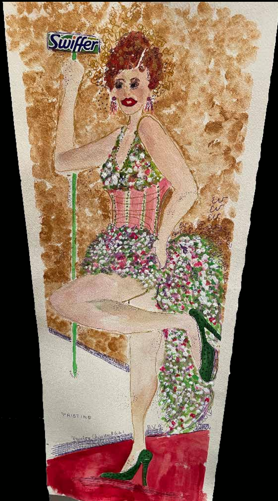
"Pristine" Watercolor, Ink, & Cut-out 24" x 18"