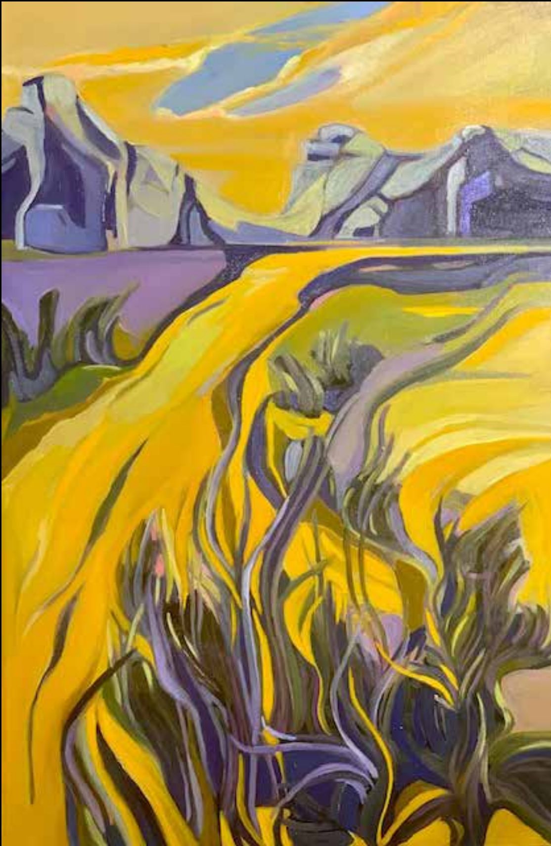
"Zion Sunset" Oil on Canvas 24" x 36"