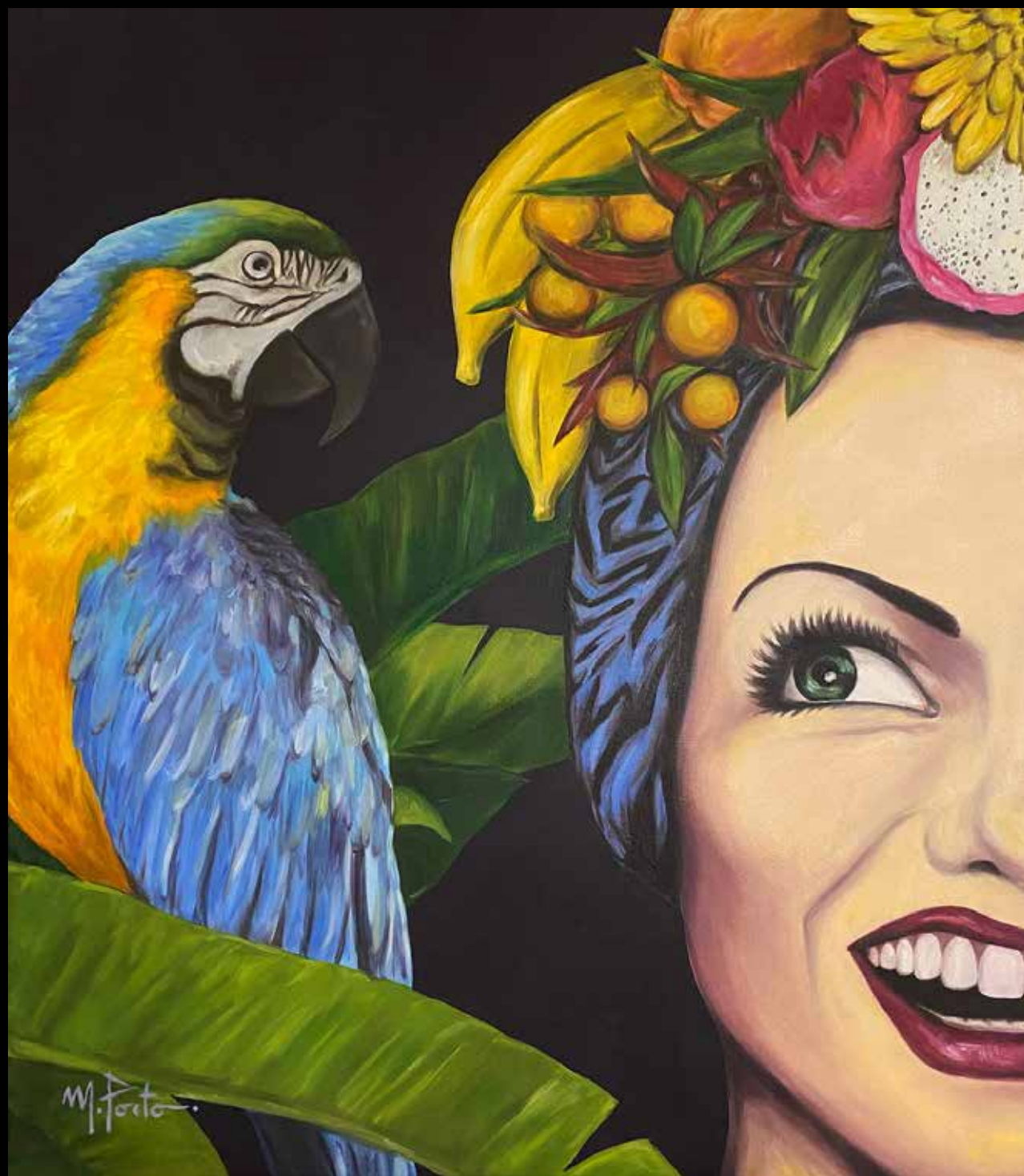
"Tropic Carmen Miranda" Oil & Acrylic on Canvas 39" x 47"