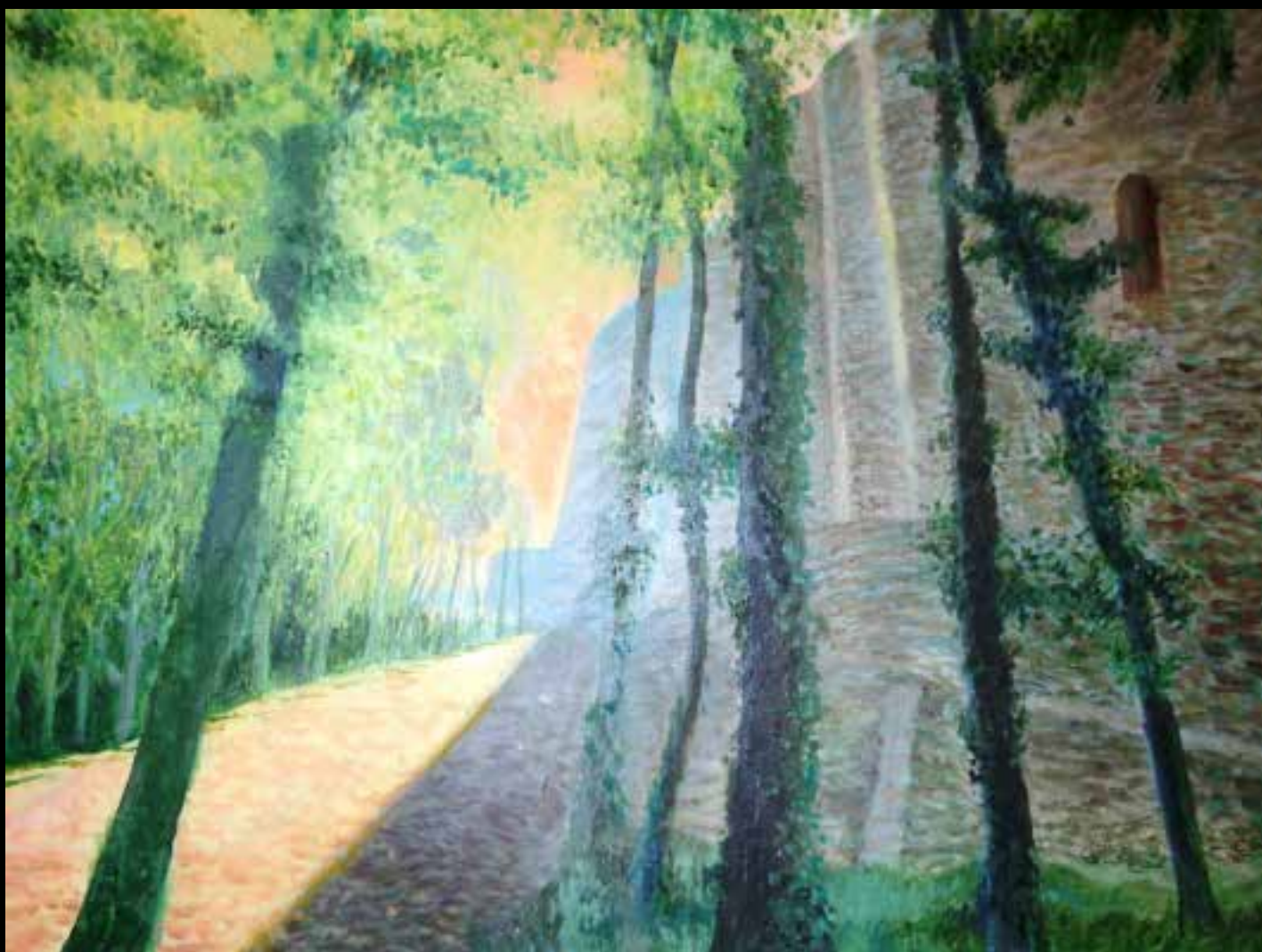
"Saint-Véran at Sunset"