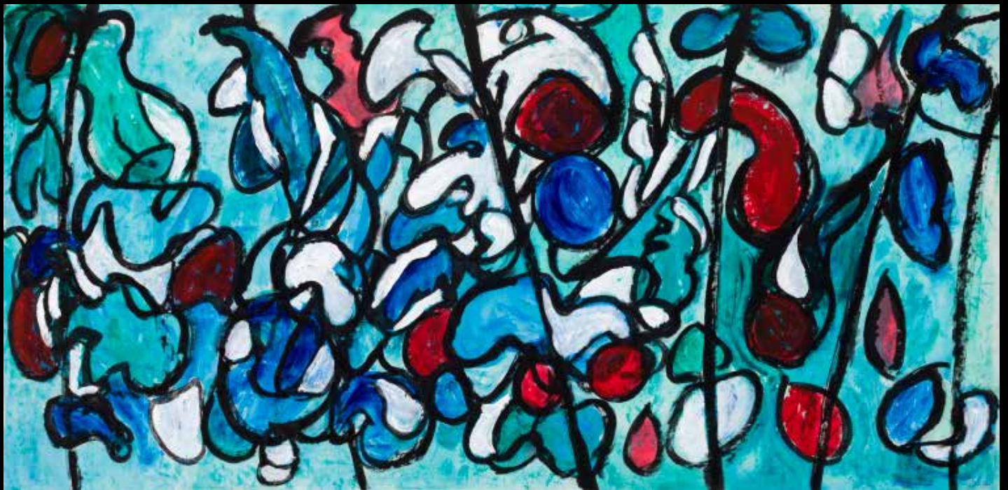
"Frontline-Conquering COVID-19" Japanese Ink & Acrylic Paint on Japanese Sumi Paper 66"